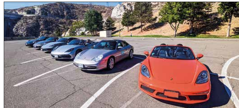
BOTTOM: Gran Tour participants meet with the members of PCA-Inland NW Region.